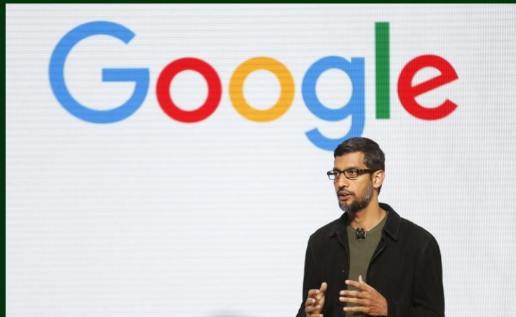
Sundar Pichai CEO, Google

“AI has the potential to be more transformative than electricity or fire.”